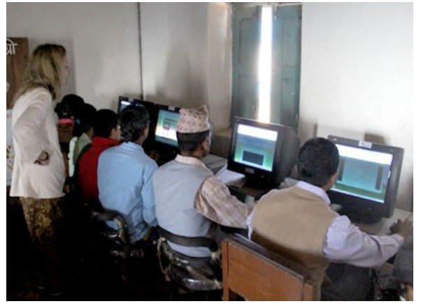
E-Pustakalya for Adults - Dumre LSS, Gorkha

The expansion of E-Pustakalaya means that more and more students, teachers and communities have access to plethora of literature, educative reference materials and videos. It has also helped schools who already have computers make a good use of their resources with the installation of the E-Pustakalaya . There has been conversations with the government of Nepal for further expansion of E-Pustakalaya in schools that have provision to buy computers through the government ICT in education programs.