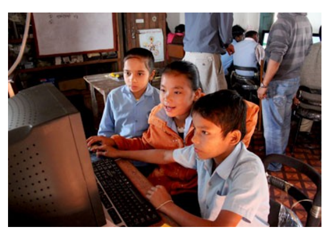
E-Pustakalaya for Kids - Dumre LSS, Gorkha