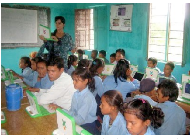
E-Pustakalya being used in classroom - Banke

Expansion of E-Pustakalaya entails informing the schools on the activities and cost of the E-Pustakalya installation, which is then followed by deployment after the agreement is signed. During the deployment of E-Pustakalya , the school infrastructure is observed and an interaction